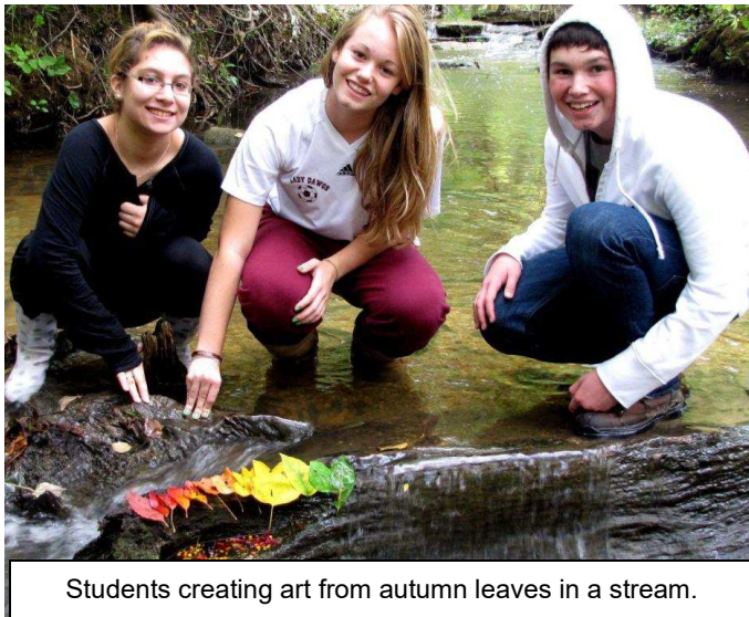
Students creating art from autumn leaves in a stream.

The Voices from the Land (Voices) project is an exploration and celebration of oral and written language... of science, art, performance... and the human imagination. Voices projects can be done with people of all ages and abilities... in any landscape... using any language.