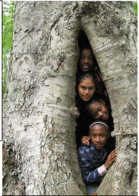
Exploring the site – Voices students

"I can't wait to get back to the classroom... I loved how Voices ties into the arts and nature."